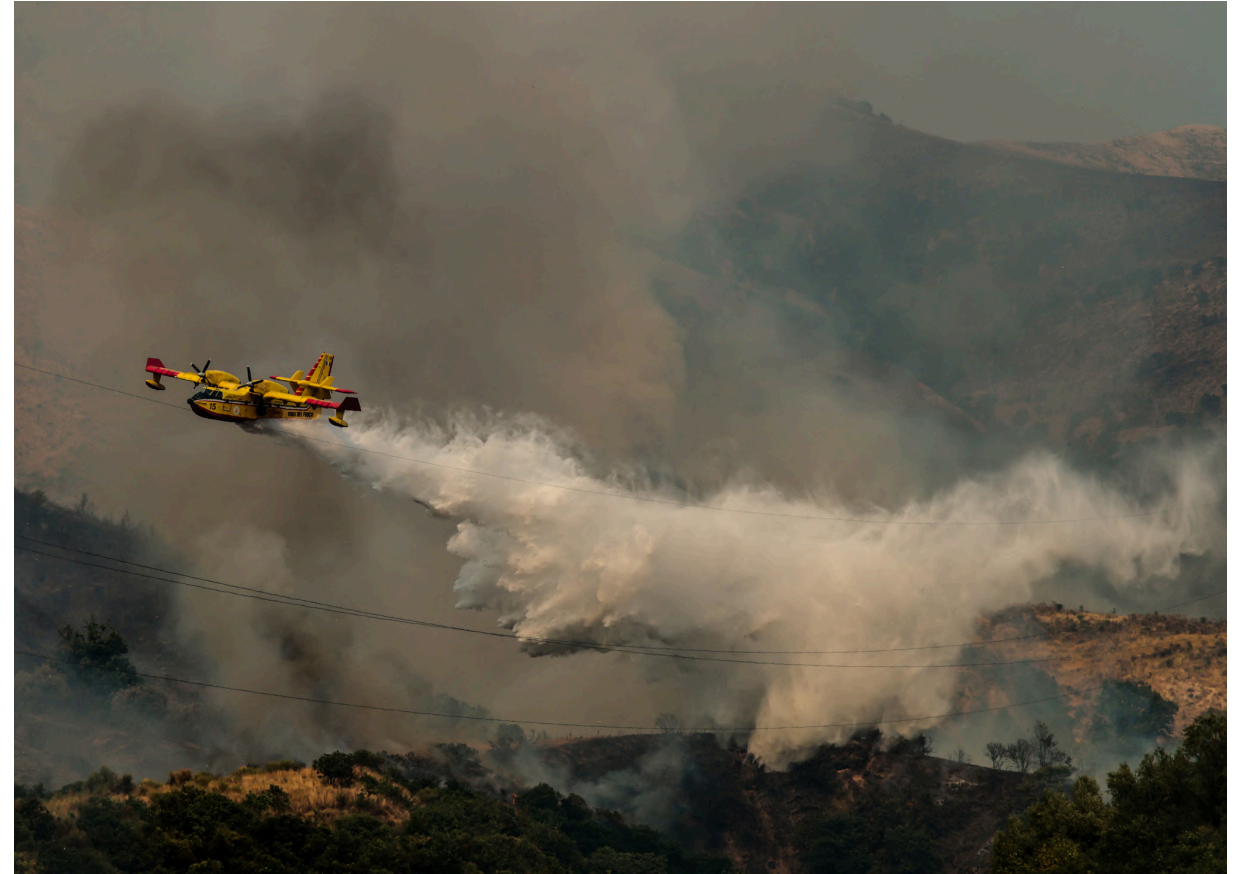
Albania – Delvina August 13, 2025: An aerial firefighting plane drops water over wildfire-affected areas as part of Italian assistance efforts on wildfire damage in Delvina on August 13, 2025.