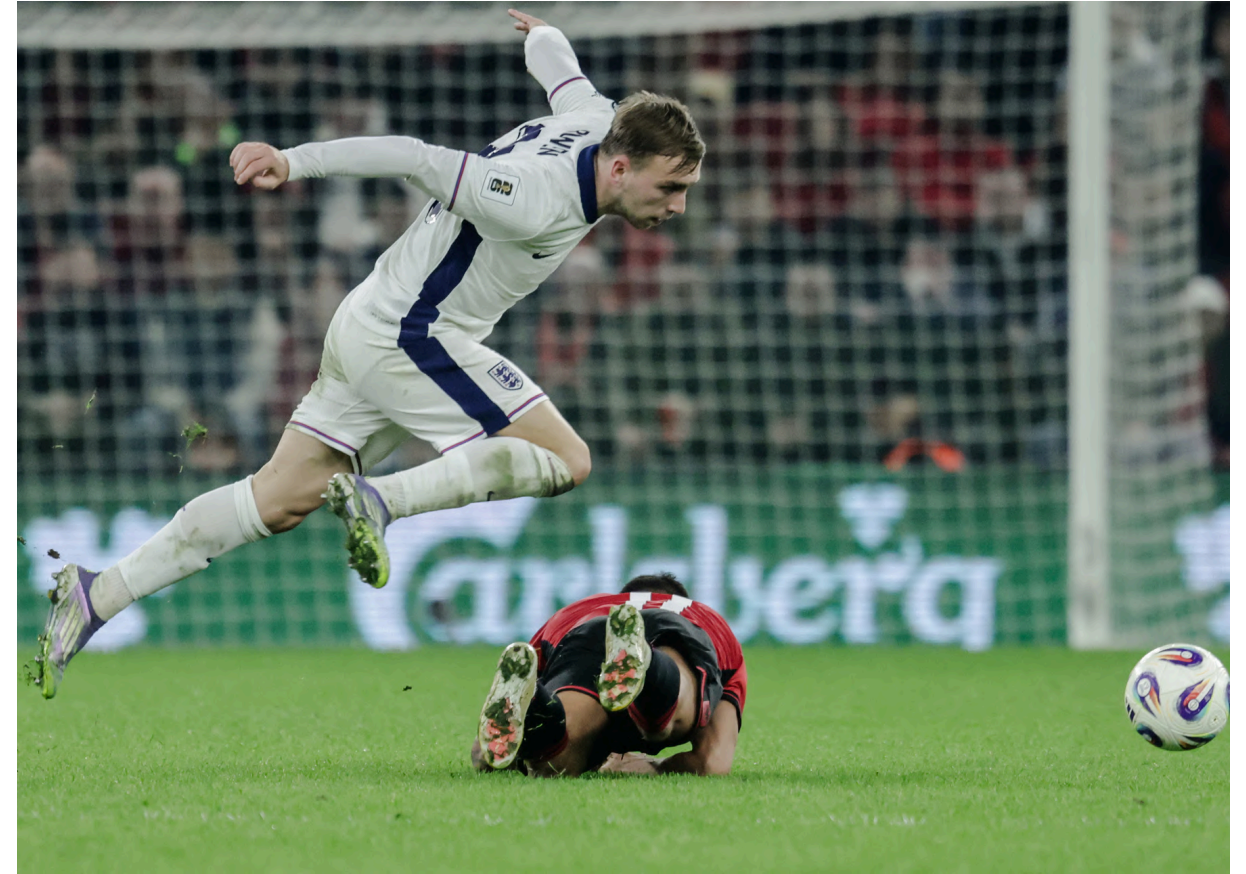
TIRANA, ALBANIA - NOVEMBER 16: NEngland's Jarrod Bowen, left, goes for the ball as Albania's Myrto Uzuni falls during the FIFA World Cup 2026 qualifier match between Albania and England at Air Albania Stadium on November 16, 2025 in Tirana, Albania.