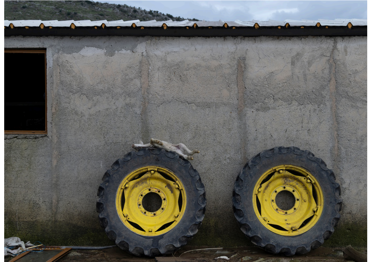
CUKE NEAR SARANDA, ALBANIA -NOVEMBER 22,2025: Drowned sheep at a flooded farm in near Saranda, Southern Albania.