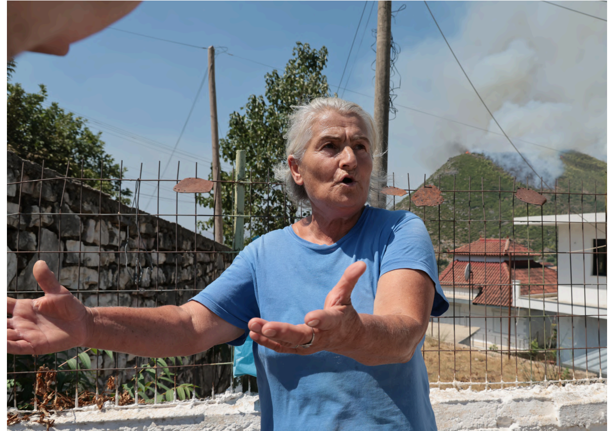
Albania – Delvina August 13, 2025: A resident gestures with her hands as wildfire continues to burn in the hills behind her on wildfire damage in Delvina on August 13, 2025.