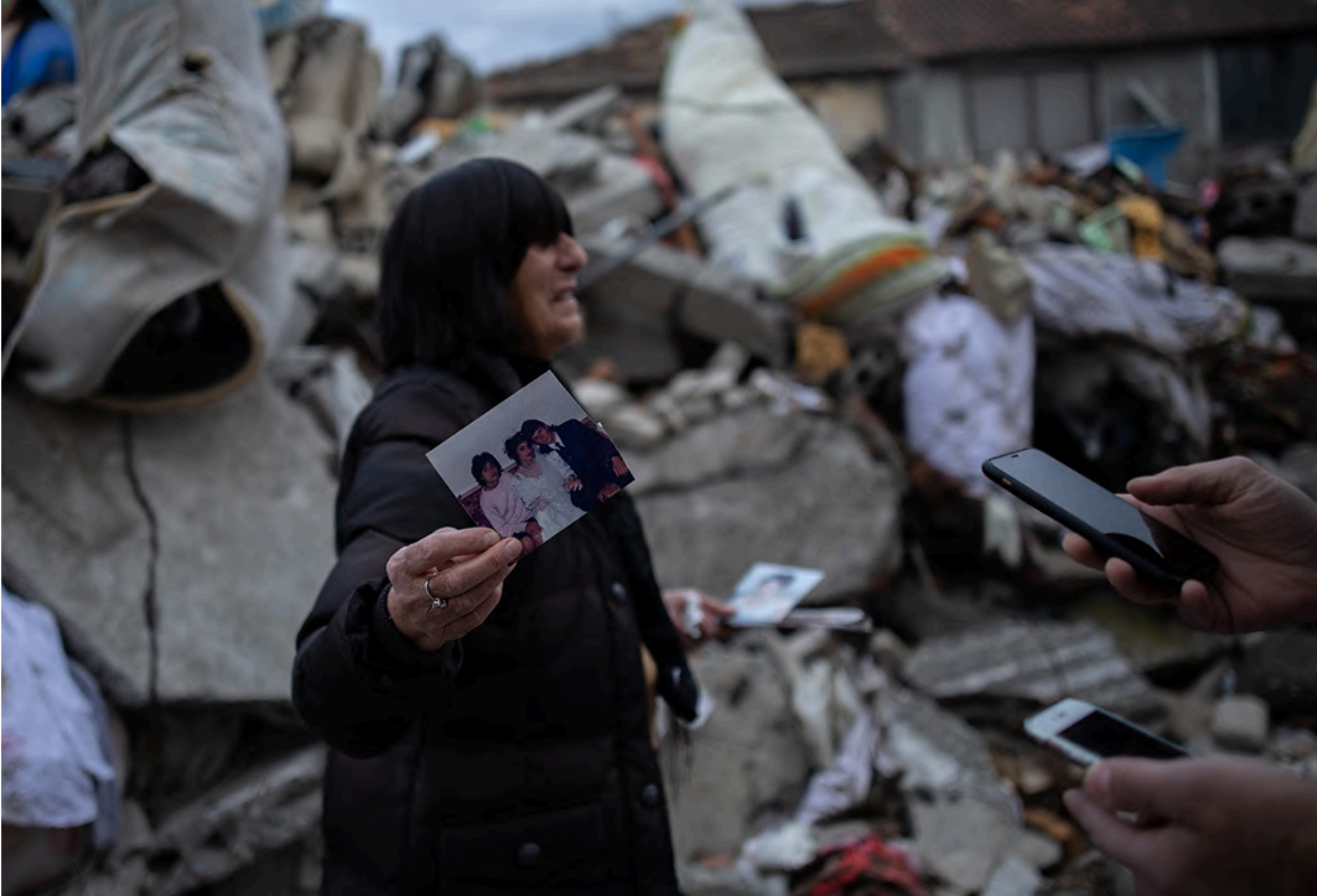
THUMANE, ALBANIA – November 29, 2019: A woman searches for her personal belongings amid the rubble of a collapsed apartment building after a powerful earthquake struck the area.