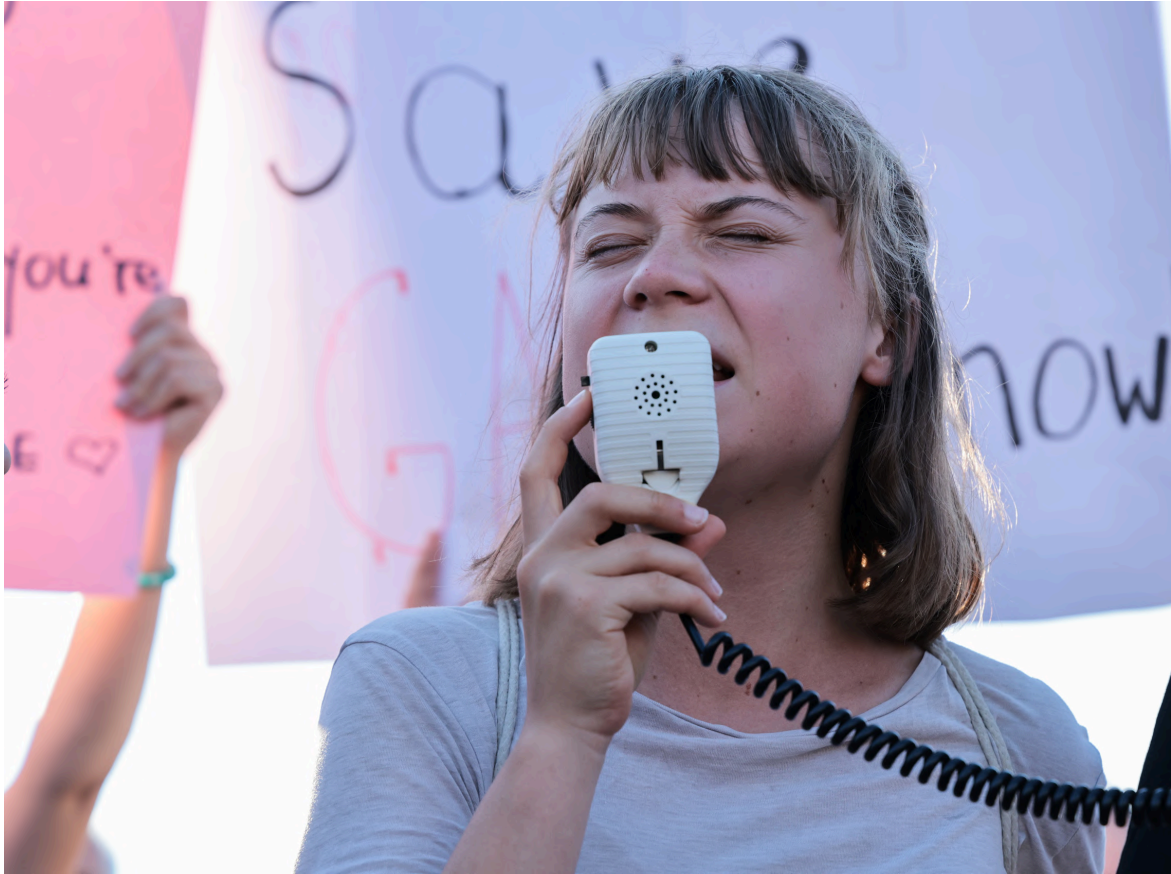
TIRANA, ALBANIA – JULY 23, 2025: Climate activist Greta Thunberg participates in a protest at Skanderbeg Square advocating for Gaza on July 23, 2025, engaging with the crowd and drawing attention to environmental and humanitarian issues.