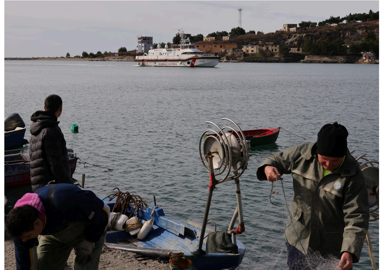
ALBANIA, SHENGJIN – FEBRUARY 1, 2025: An Italian Coast Guard vessel approaches the port of Shengjin due to transfer migrants from the asylum processing centers in Albania back to Italy, in Shengjin, northwestern Albania, February 1, 2025.