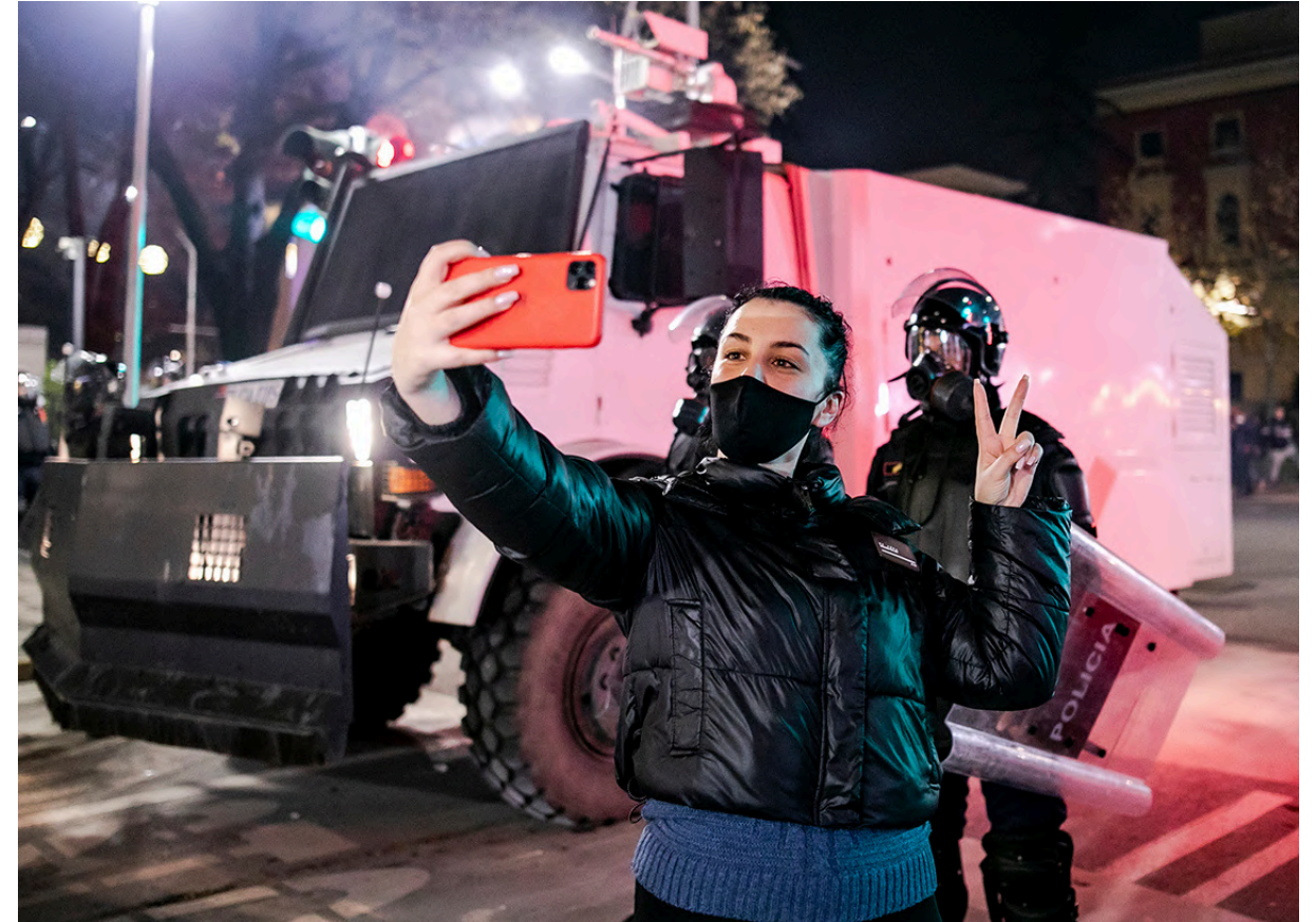
TIRANA, ALBANIA – DECEMBER 14, 2020: A young protester poses for a selfie showing a peace sign in front of police officers during a demonstration over the killing of 25-year-old Klodian Rasha by police in Tirana, Albania, December 12, 2020.