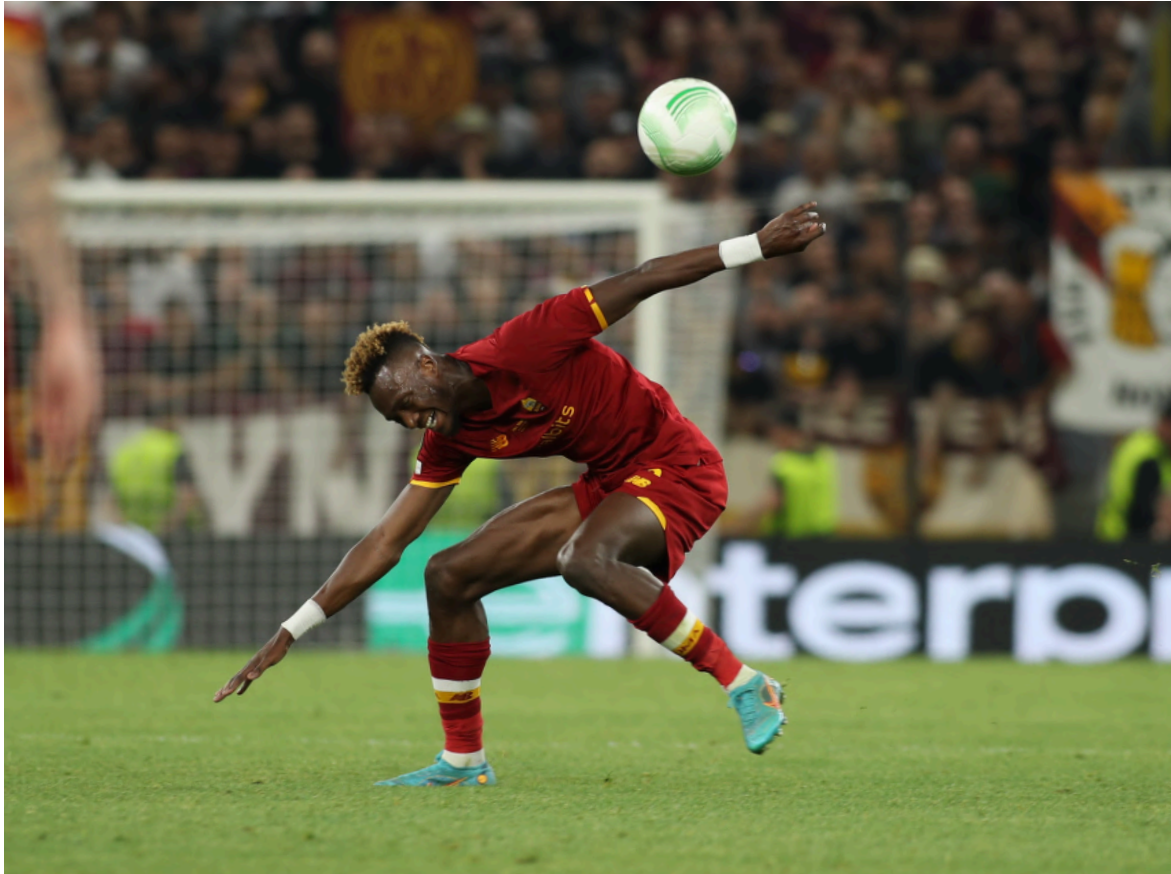
TIRANA, ALBANIA - MAY 25: Tammy Abraham of AS Roma reacts reacted with laughter because the ball went over him during the UEFA Conference League final match between AS Roma and Feyenoord at Arena Kombetare on May 25, 2022 in Tirana, Albania.