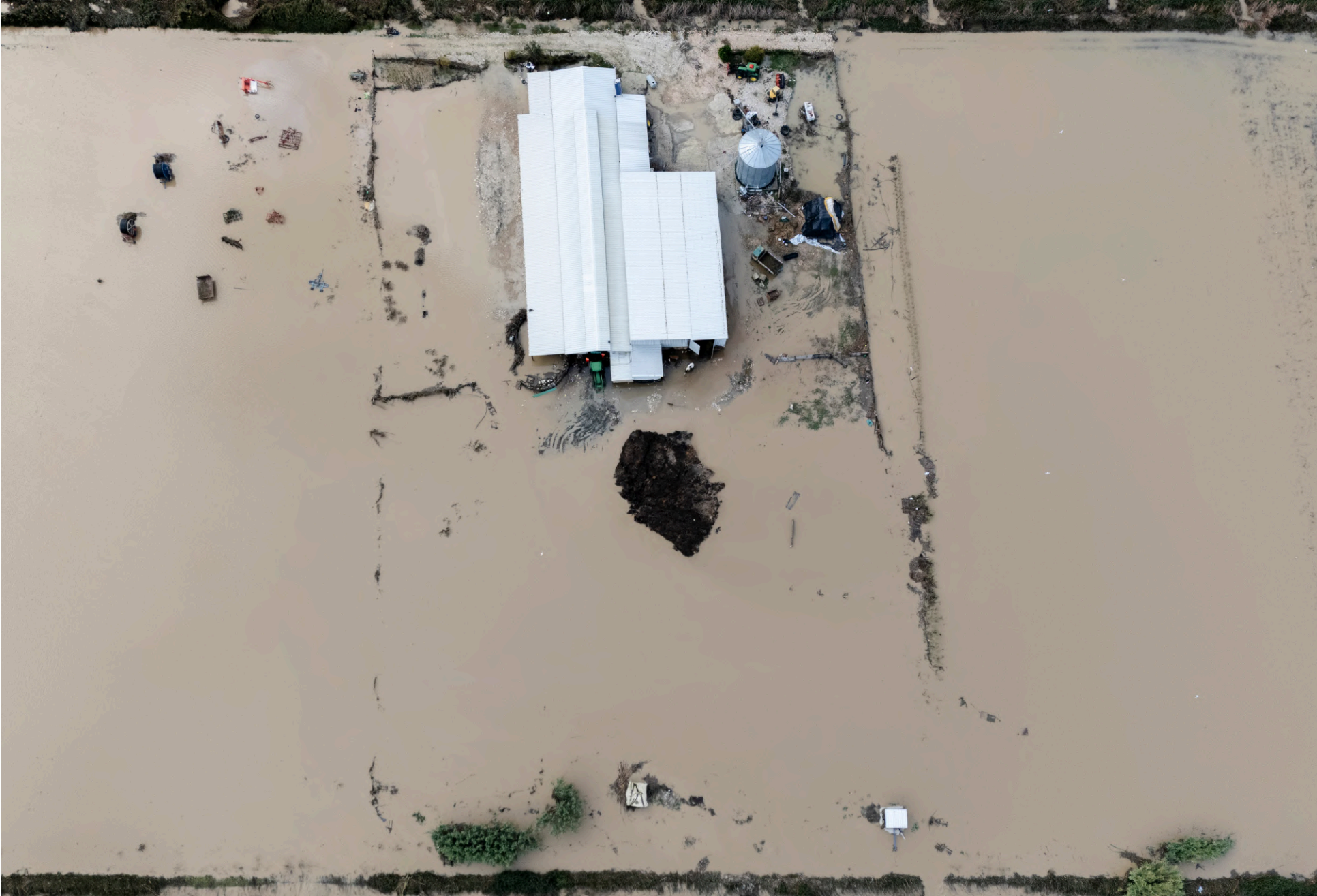
CUKE NEAR SARANDA, ALBANIA -NOVEMBER 22,2025 An aerial view from a drone shows a farm submerged in floodwaters following heavy rains on November, Southern, Albania 22, 2025.