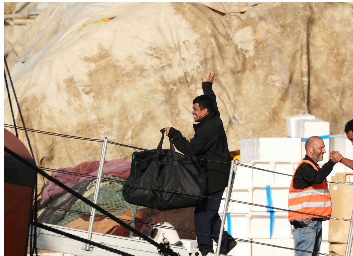
ALBANIA, SHENGJIN – OCTOBER 19, 2024: A migrant intercepted in international waters and sent to a reception facility in Albania earlier this week, boards an Italian coast guard vessel at the port of Shengjin, Albania, with destination Italy after a court in Rome rejected their detention.