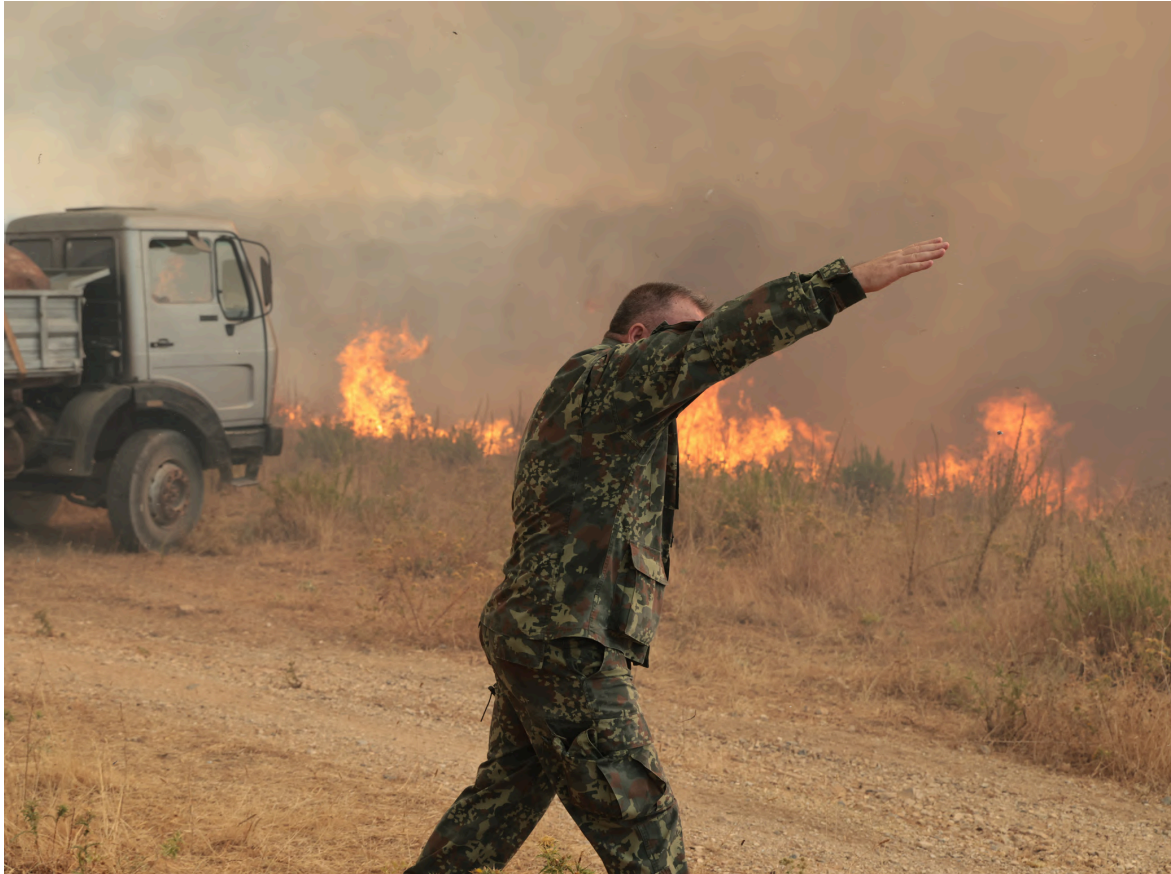
Albania – Delvina August 13, 2025: A army commander gestures for assistance as wildfire approaches nearby areas on wildfire damage in Delvina on August 13, 2025.