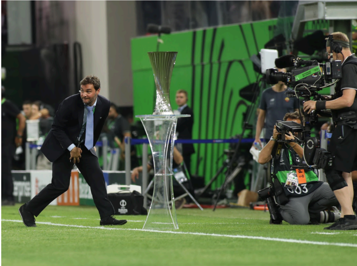
TIRANA, ALBANIA - MAY 25, 2025: UEFA officer passing near to the trophy, during the UEFA Conference League final match between AS Roma and Feyenoord at Arena Kombetare on May 25, 2022 in Tirana, Albania.