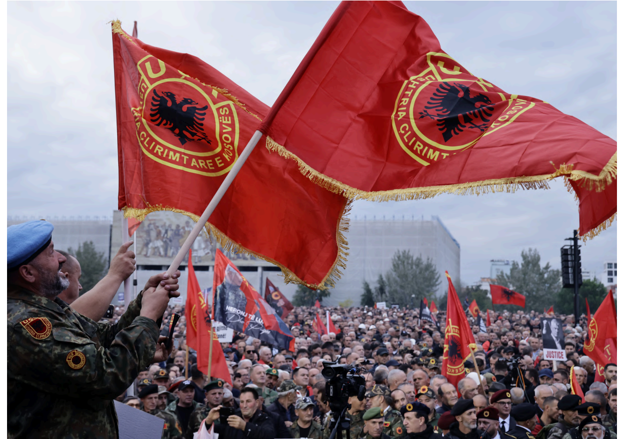
TIRANA, ALBANIA – OCTOBER 17, 2025: Former UÇK soldiers wave flags during a march at Skanderbeg Square in October 17 2025, calling for the release of Kosovo Liberation Army leaders held at The Hague