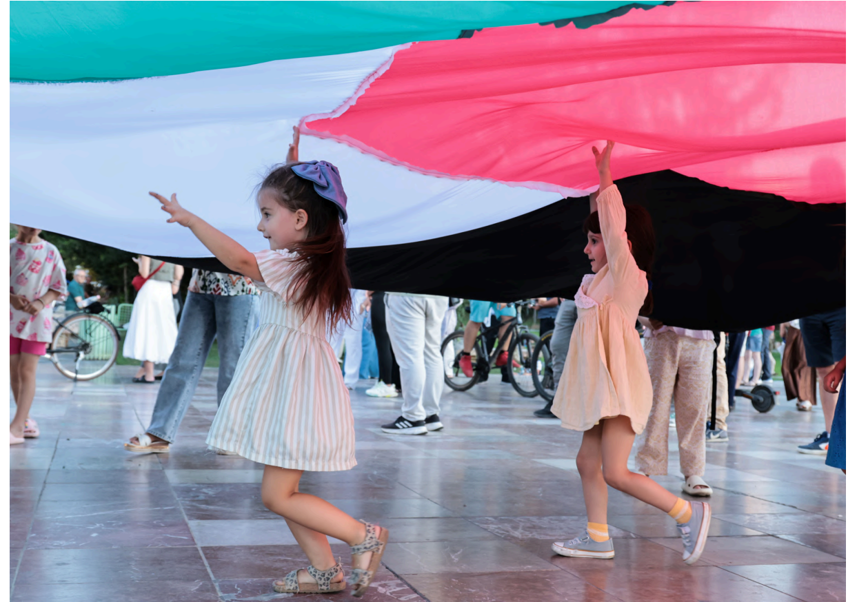
TIRANA, ALBANIA – MAY 13, 2020: Children hold Palestinian flags during a protest at Skanderbeg Square on July 23, 2025, part of a demonstration led by activist Greta Thunberg calling for solidarity with Gaza.