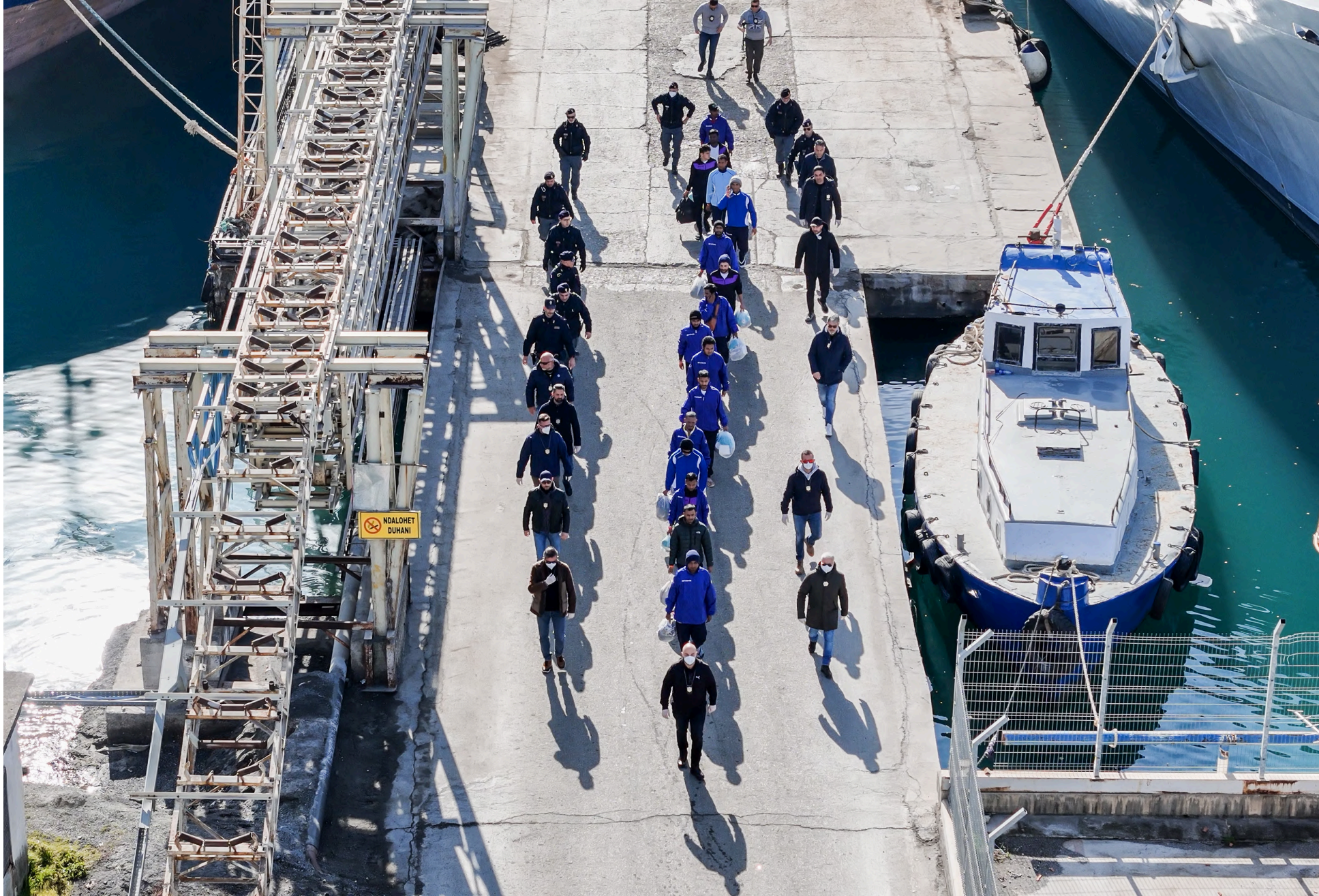
ALBANIA, SHENGJIN- January 28, 2025: An aerial photograph taken by a drone shows migrants escorted by Italian police going for processing following earlier court rejections, in the port of Shengjin, northwestern Albania, January 28, 2025.