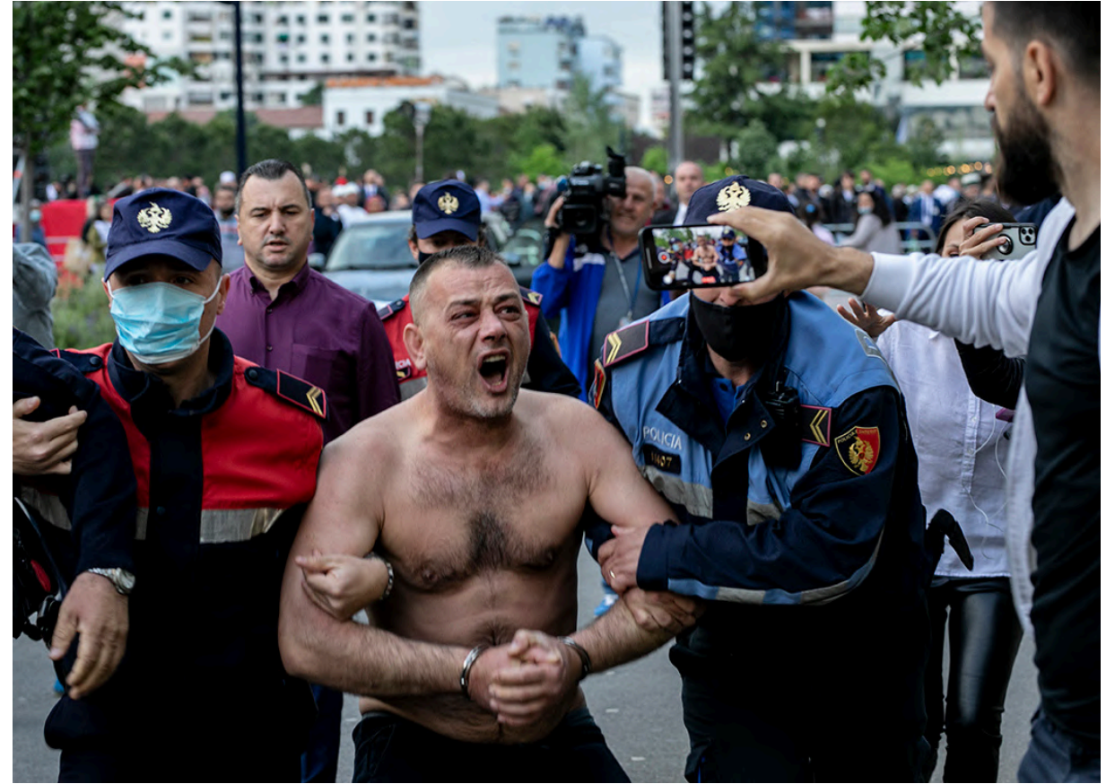
TIRANA, ALBANIA – MAY 13, 2020: Police detain a man in handcuffs after he attempted to set himself on fire in the middle of worshippers at Skanderbeg Square during Eid al-Adha prayers on May 13, 2021.