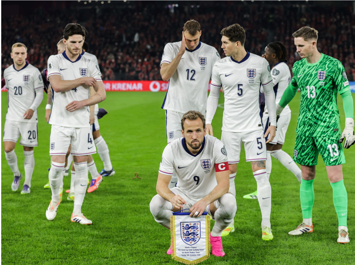
TIRANA, ALBANIA - NOVEMBER 16: Harry Kane waiting other players of England to pose for a photo prior to the FIFA World Cup 2026 qualifier match between Albania and England at Air Albania Stadium on November 16, 2025 in Tirana, Albania.