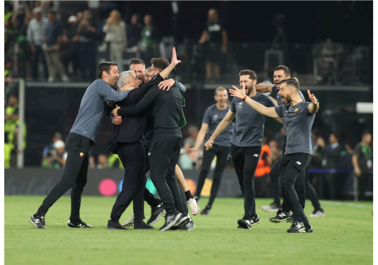
TIRANA, ALBANIA - MAY 25, 2025: Jose Mourinho, Manager of AS Roma celebrates with his team at the full-time whistle during the UEFA Conference League final match between AS Roma and Feyenoord at Arena Kombetare on May 25, 2022 in Tirana, Albania.