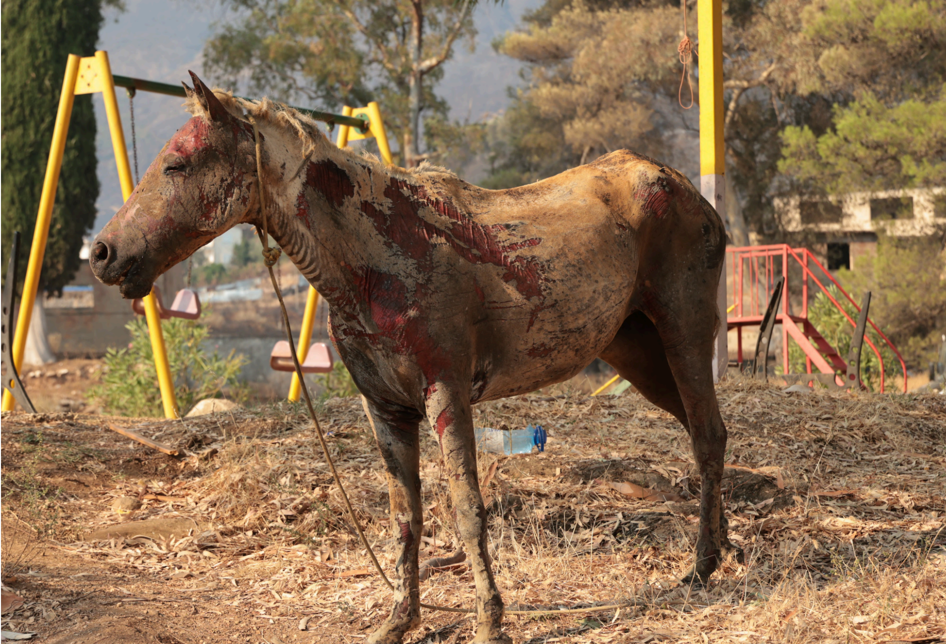
Albania – Delvina August 13, 2025: A horse is injured by wildfire damage in Delvina on August 13, 2025.