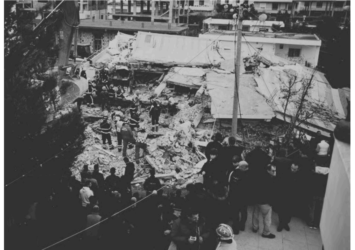
DURRES ALBANIA – November 27, 2019

Italian search and rescue workers look for survivors stuck under the rubble of a collapsed building in the town of Durres, western Albania on November 27, 2019, after an earthquake hit Albania. with nearly 30 dead found so far and more than 40 rescued alive.