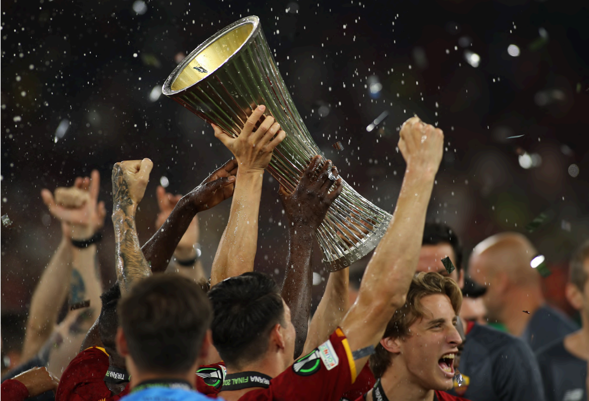
TTIRANA, ALBANIA - MAY 25, 2022: Tammy Abraham of AS Roma lifts the UEFA Europa Conference League Trophy after their sides victory during the UEFA Conference League final match between AS Roma and Feyenoord at Arena Kombetare on May 25, 2022 in Tirana, Albania.