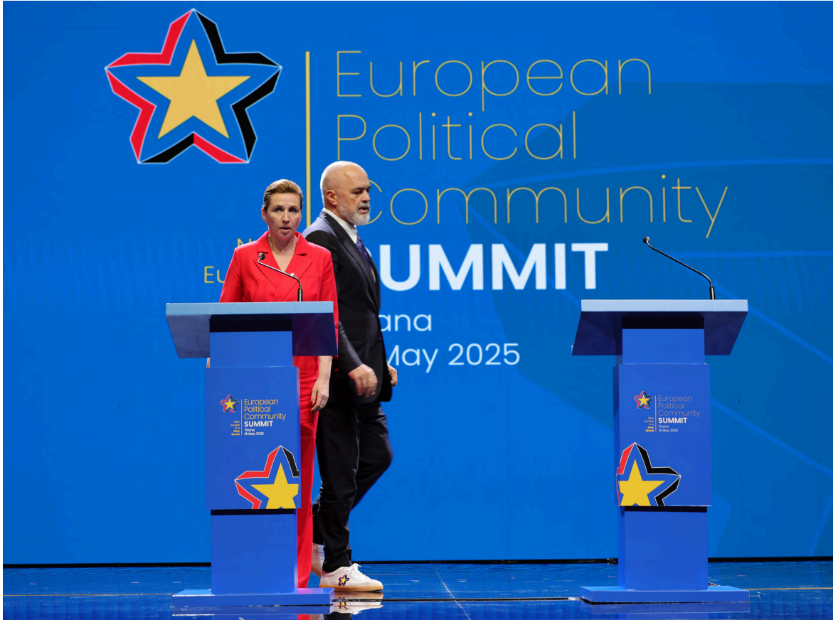
TIRANA, ALBANIA – MAY 16, 2025: Prime Minister Edi Rama, and Danish Prime Minister Mette Frederiksen join a press conference after the European Political Community Summit, in Tirana, Albania, May 16, 2025.