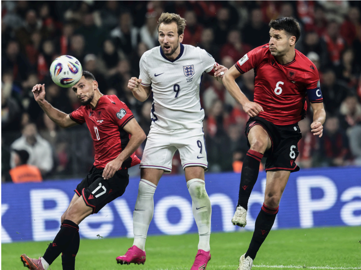
TIRANA, ALBANIA - NOVEMBER 16: Harry Kane of England scores his team's second goal during the FIFA World Cup 2026 qualifier match between Albania and England at Air Albania Stadium on November 16, 2025 in Tirana, Albania.