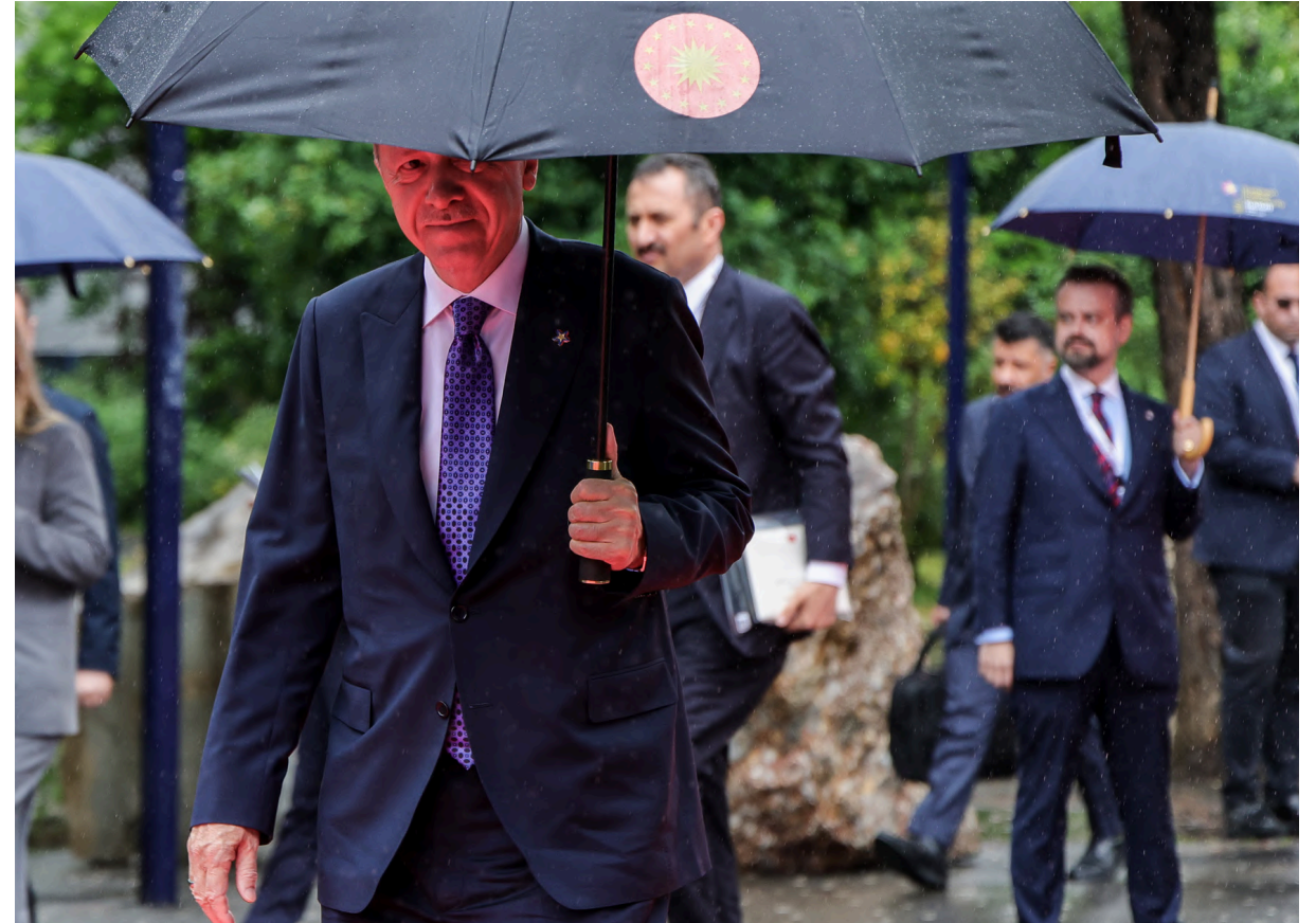
TIRANA, ALBANIA – MAY 16, 2025: Turkish President Recep Tayyip Erdogan arrives for of a summit where the leaders of 47 European countries and organizations will discuss security, defense and democratic standards against the backdrop of Russia's war on Ukraine.