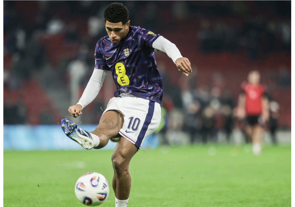
TIRANA, ALBANIA - NOVEMBER 16: Jude Bellingham of England warms up ahead on the pitch prior to the FIFA World Cup 2026 qualifier match between Albania and England at Air Albania Stadium on November 16, 2025 in Tirana, Albania.