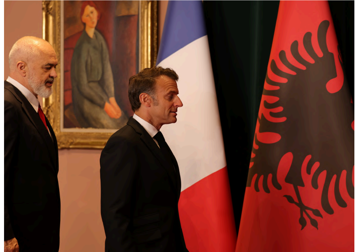
TIRANA, ALBANIA – MAY 17, 2025: Prime Minister Edi Rama walks toward the conference room with French President Emmanuel Macron during an official meeting at the Prime Minister's Office on May 17, 2025.