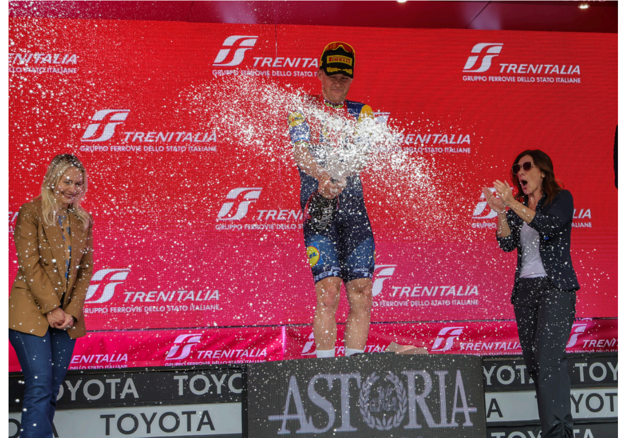
Lidl-Trek's Danish rider Mads Pedersen wears the overall leader pink jersey (Maglia Rosa) as he celebrates on the podium after winning the first stage of the 108th Giro d'Italia cycling race, 160km from Durres to Tirana in Albania, on May 9, 2025.