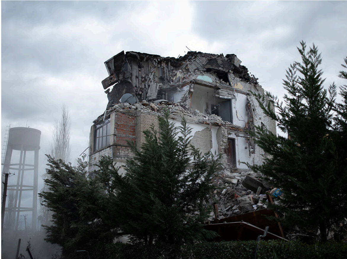
THUMANE, ALBANIA – November 29, 2019

Dust rises from falling parts of a destroyed building during an aftershock in Thumane, western Albania