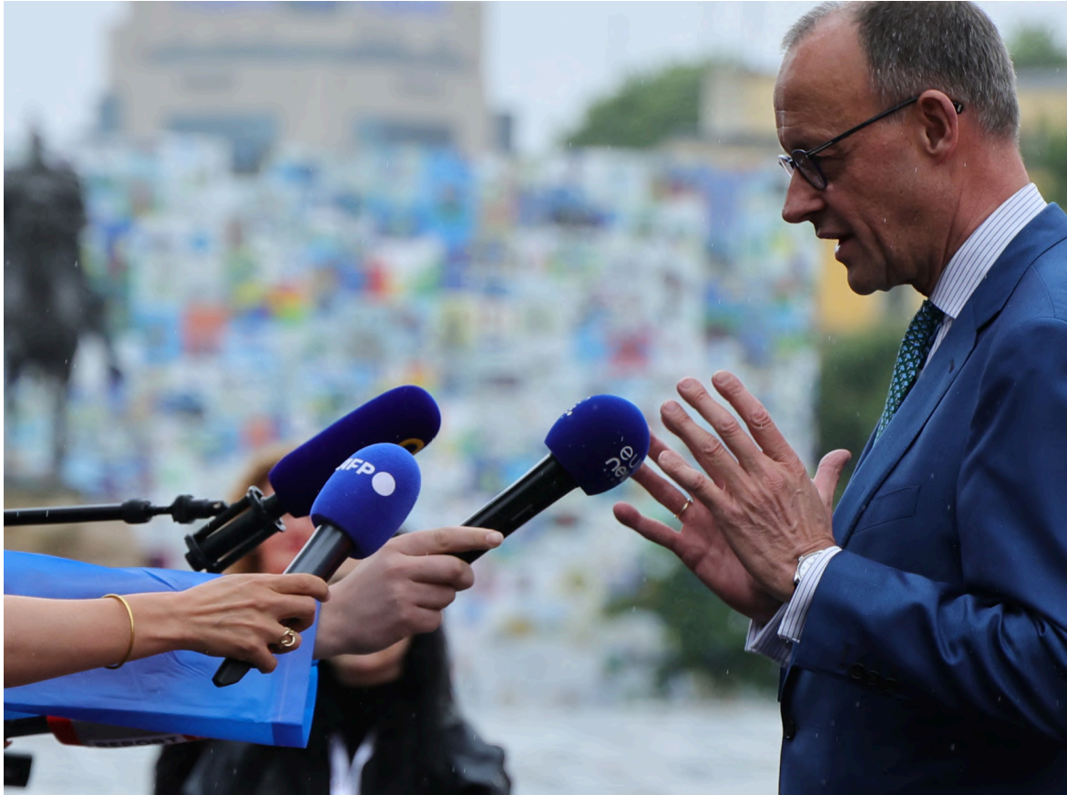
TIRANA, ALBANIA – MAY 16, 2025: Germany's Federal Chancellor Friedrich Merz makes statements ahead of a summit where the leaders of 47 European countries and organizations will discuss security, defense and democratic standards against the backdrop of Russia's war on Ukraine.