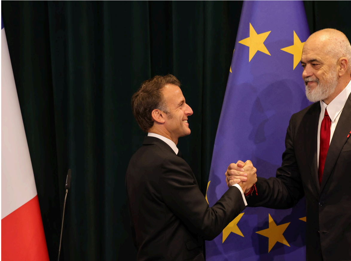
TIRANA, ALBANIA – MAY 17, 2025: Prime Minister Edi Rama shakes hands with French President Emmanuel Macron during a joint news conference, during a bilateral meeting in Tirana, May 17, 2025.