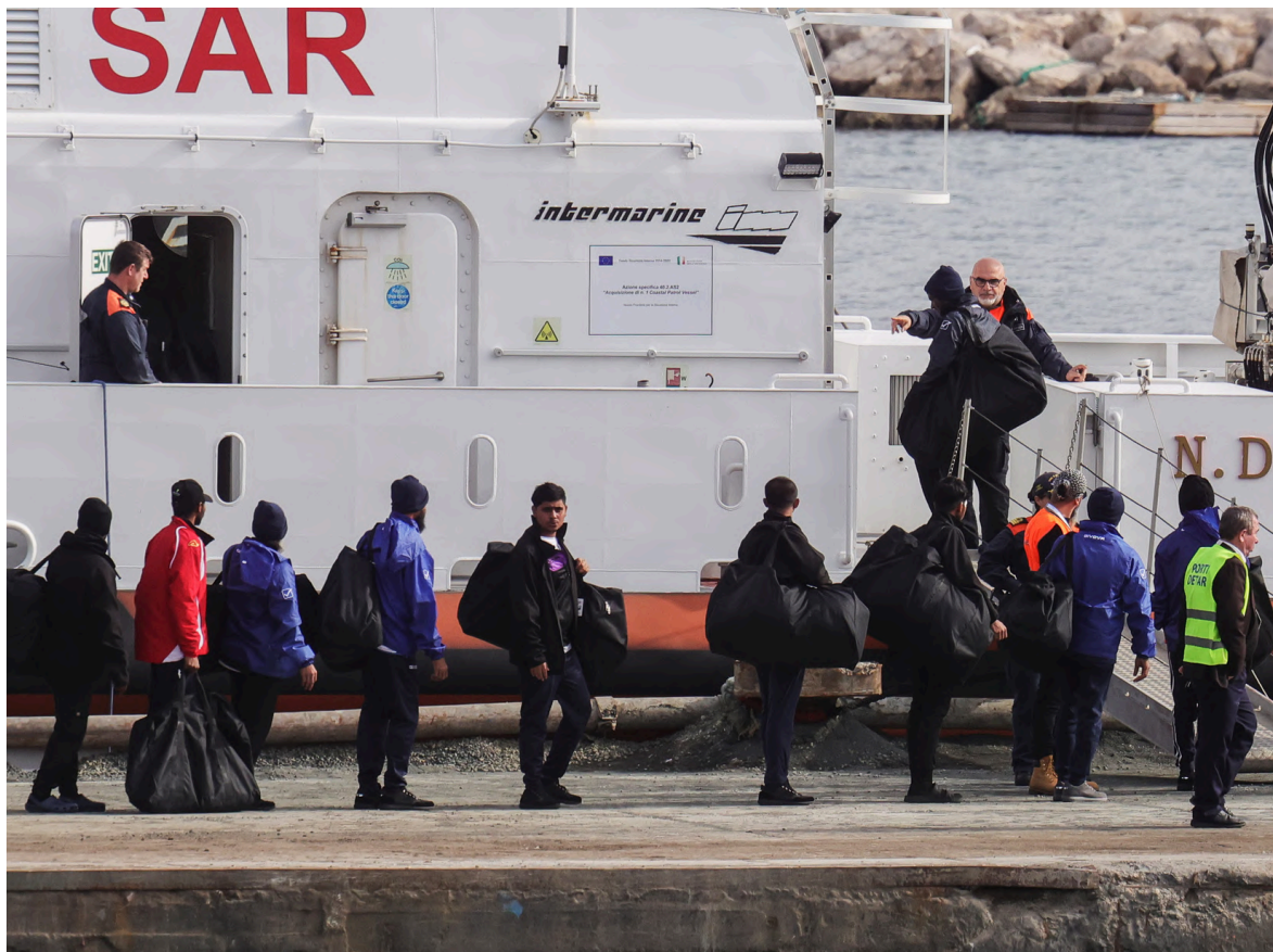
ALBANIA, SHENGJIN – FEBRUARY 1, 2025: Migrants board an Italian Coast Guard vessel as part of a transfer operation from the asylum processing centers in Albania back to Italy following a court decision in Rome, at the port of Shengjin, northwestern Albania, February 1, 2025.