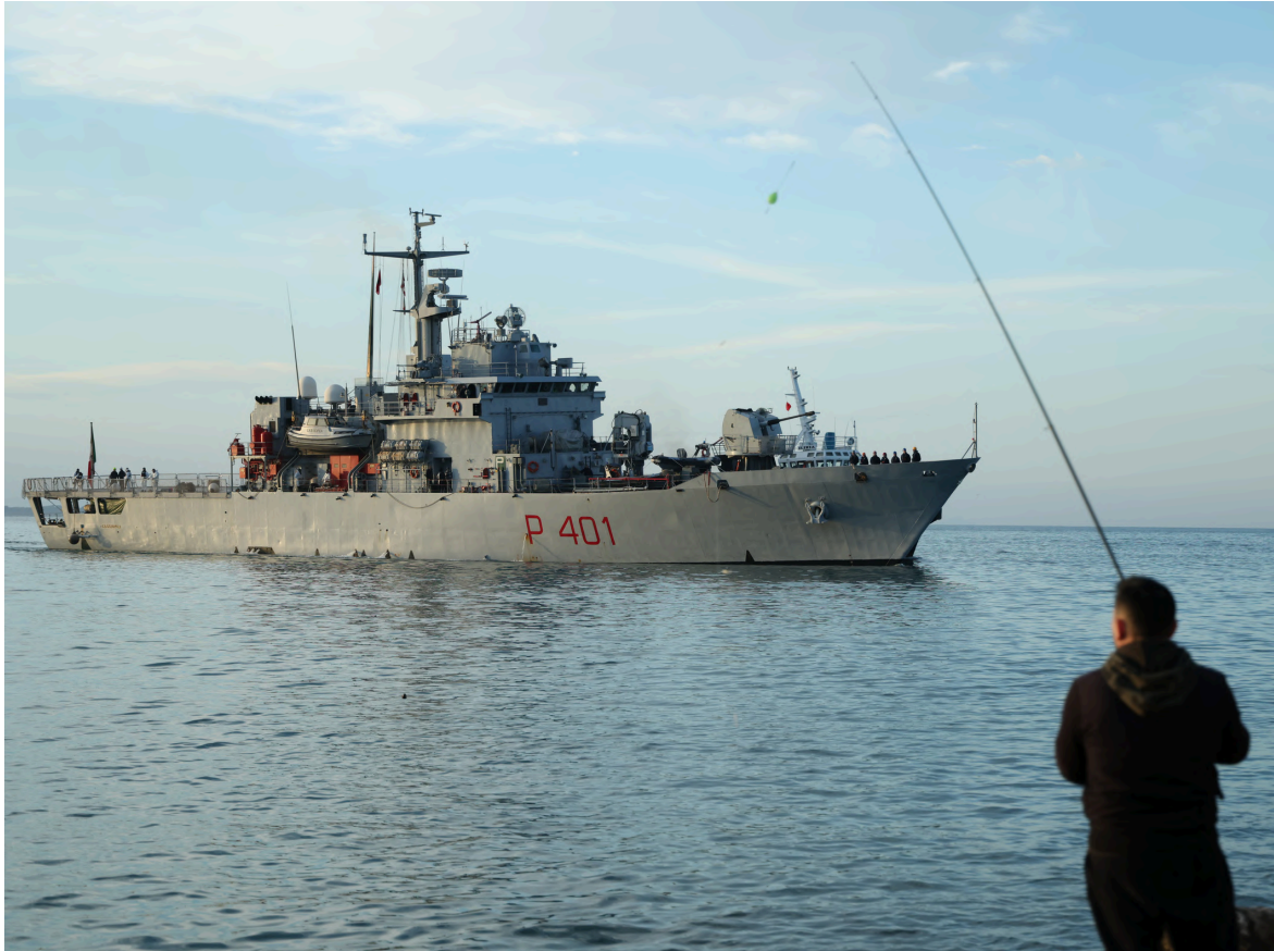
ALBANIA, SHENGJIN – JANUARY 28, 2025: An Italian navy Libra approaches the port, as Italy sends 49 more migrants to Albania for processing following earlier court rejections, in Shengjin, northwestern Albania, January 28, 2025.