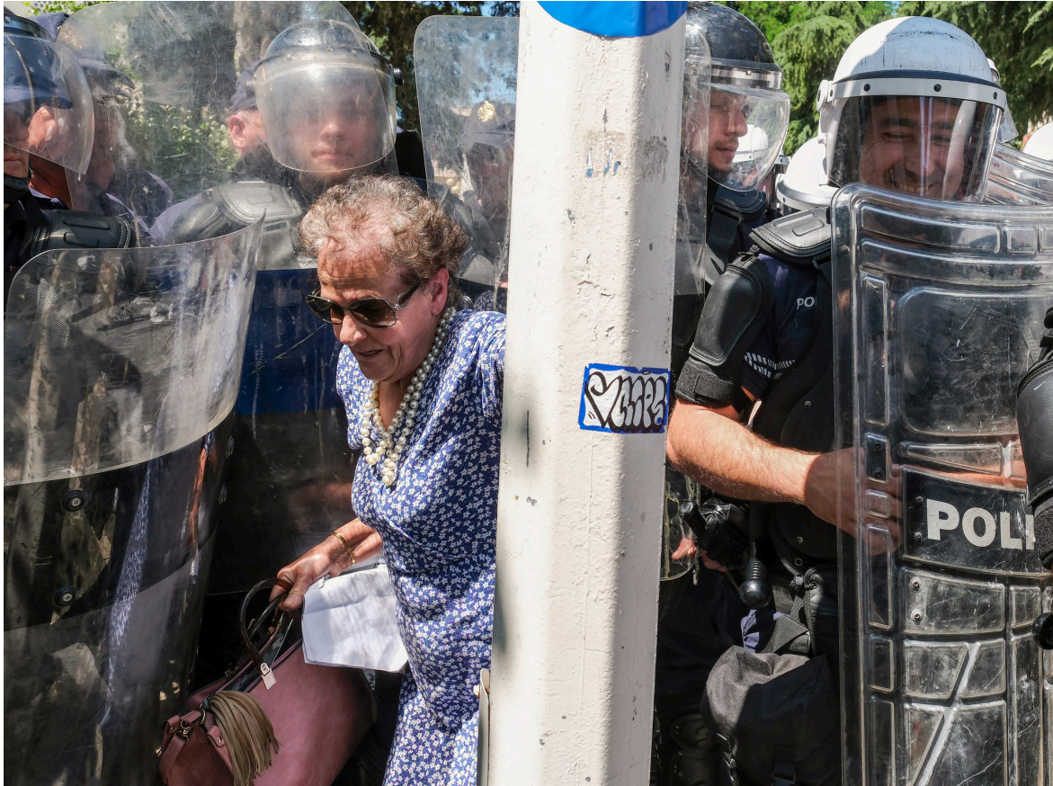
TIRANA, ALBANIA – JUNE 23, 2024: An elderly woman is pushed by police during a protest in front of the Parliament in June,23 2024. One officer in riot gear is visible, smiling as he manages the crowd.