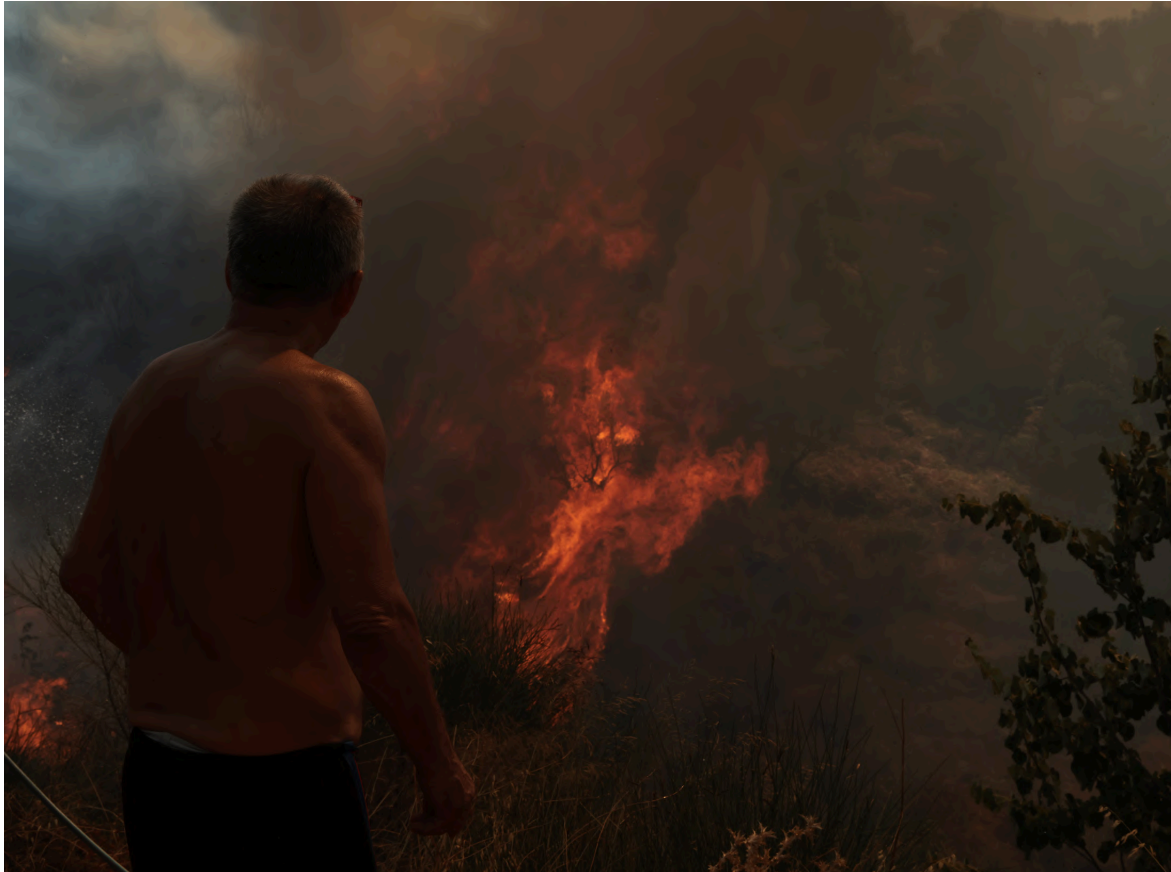
Albania – Delvina August 13, 2025: A man watches as a wildfire approaches his home on wildfire damage in Delvina on August 13, 2025.