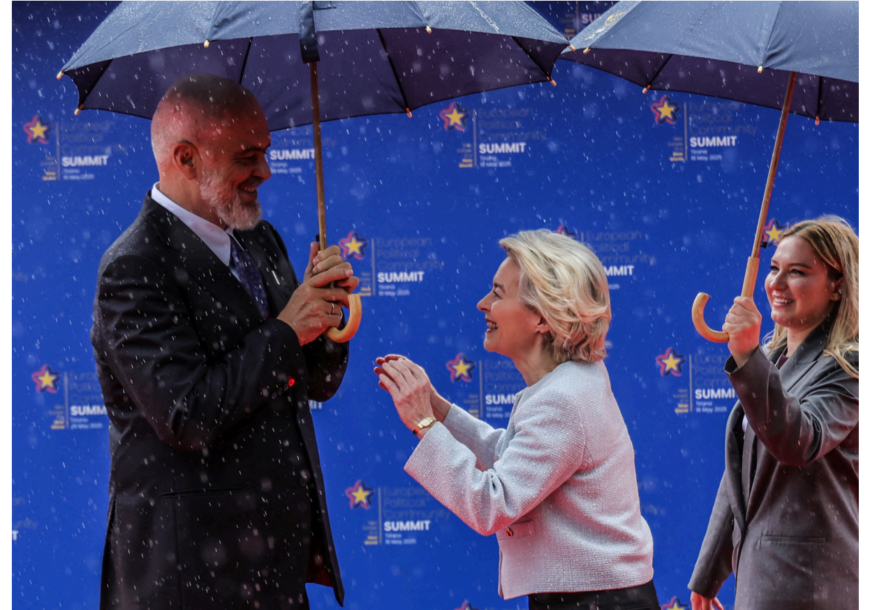
TIRANA, ALBANIA – MAY 16, 2025: Prime Minister Edi Rama is greeted by European Commission President Ursula von der Leyen holding an umbrella at the doorstep during the summit where the leaders of 47 European countries and organizations will discuss security, defense and democratic standards against the backdrop of Russia's war on Ukraine, AP Topix Summit.