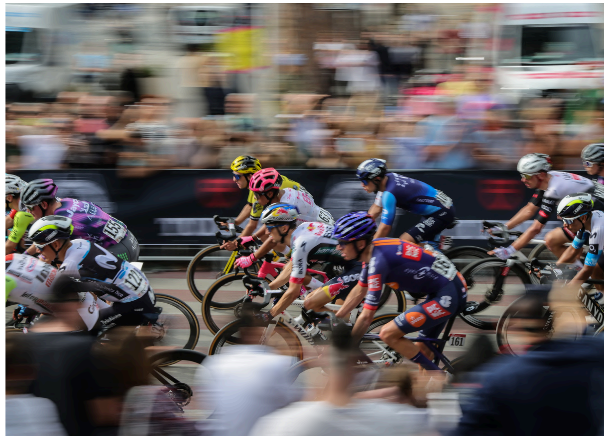
TIRANA, ALBANIA - MAY 09: A general view of the peloton passing through Tirana city landscape during the 108th Giro d'Italia 2025, Stage 1 a 160km stage from Durrës to Tirana / #UCIWT / on May 09, 2025 in Tirana, Albania.