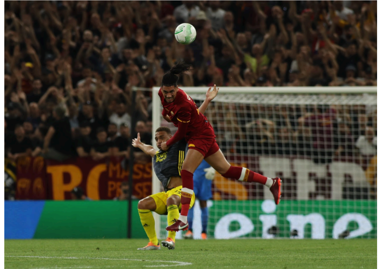
TIRANA, ALBANIA - MAY 25: Chris Smalling of AS Roma and Cyriel Dessers of Feyenoord battle for the ball during the UEFA Europa Conference League Final match between AS Roma and Feyenoord at the National Arena on May 25, 2022 in Tirana, Albania