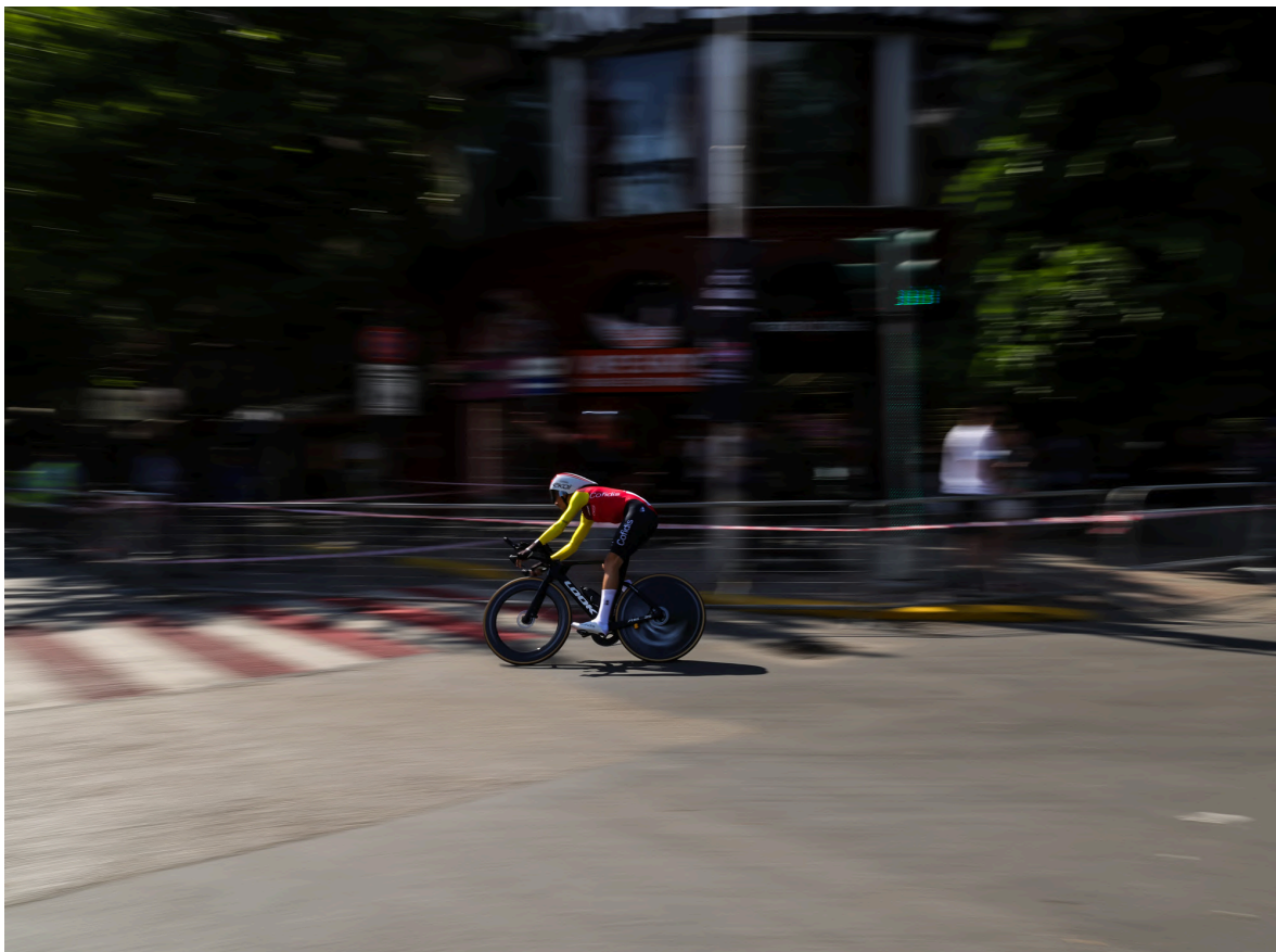
TIRANA, ALBANIA - MAY 10: Sergio Samitier of Spain and Team Cofidis competes during the 108th Giro d'Italia 2025, Stage 2 a 13.7km individual time trial stage from Tirana to Tirana / #UCIWT / on May 10, 2025 in Tirana, Albania.