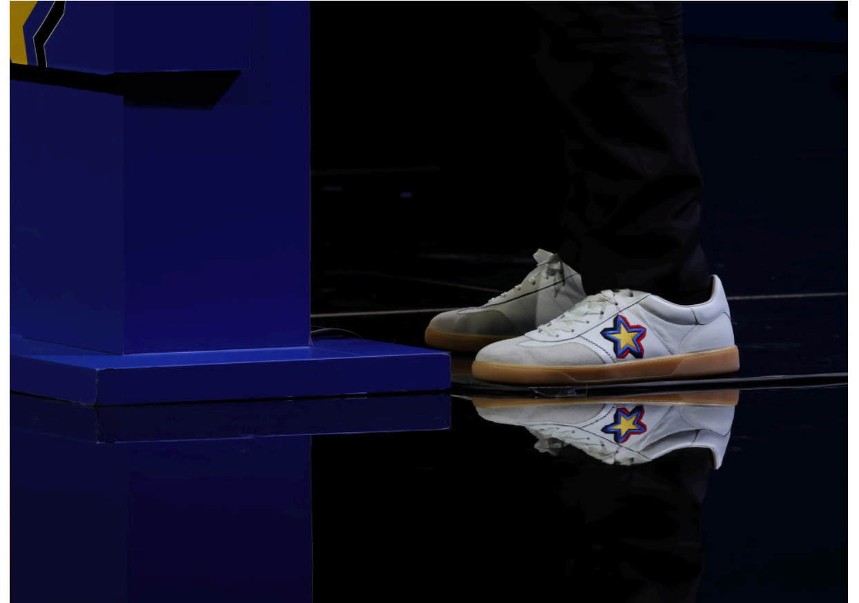
TIRANA, ALBANIA – MAY 16, 2025: The sneakers of Prime Minister Edi Rama are reflected on the floor, during a press conference with Danish Prime Minister Mette Frederiksen join after the European Political Community Summit, in Tirana, Albania, May 16, 2025.